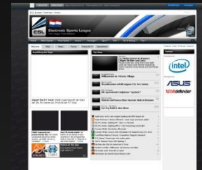
Product / Website