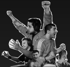
Emotions, gaming related